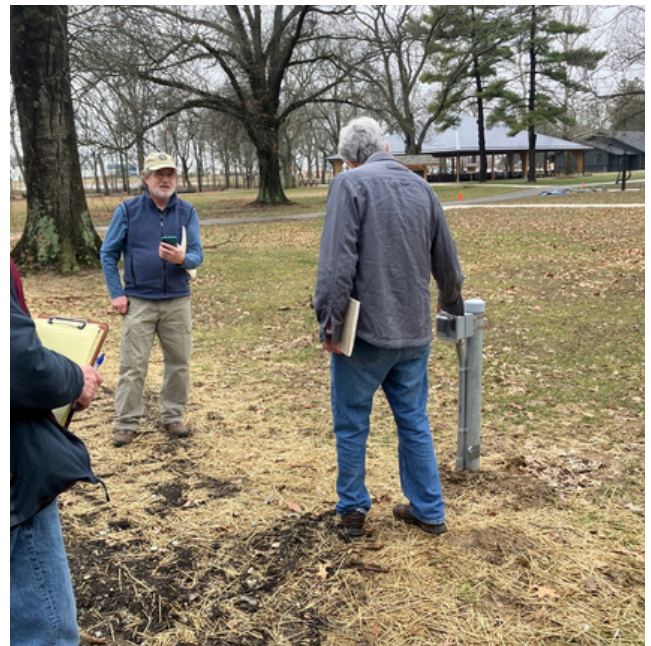
Coordinators nailing down some final touches