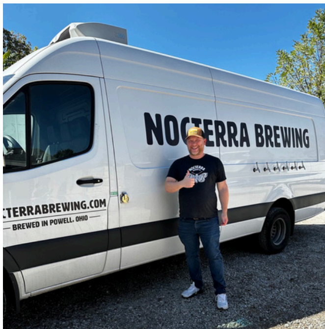
Nocterra's new serving truck

moving entrance line, and get a free flexible frisbee and sticker (while supplies last). Ticket link here: